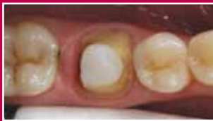
Air-thinning reveals a shiny surface