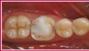
Preoperative view of the core build-up on tooth 30