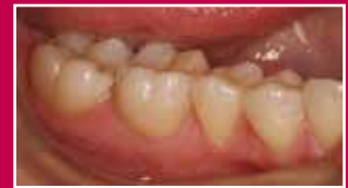
Light cure and finish/polish restoration