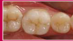
Try in to verify fit, marginal contacts and colour