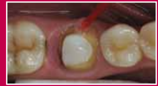
Apply primer for 15 seconds to complete conditioning