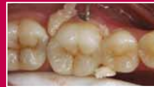
Remove excess cement