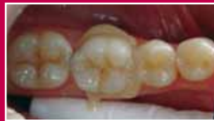
Dispense the cement into the IPS e.max ZirCAD crown and seat to displace excess cement